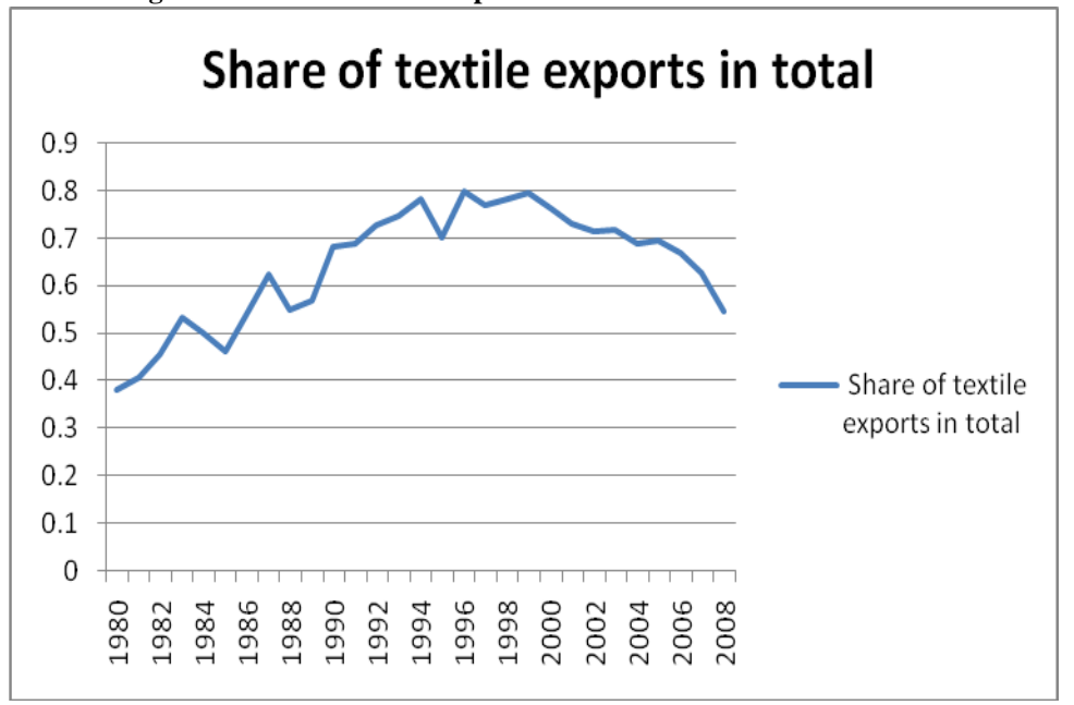
Fig. 2.2. Share of Textile Exports of Pakistan in Different Periods