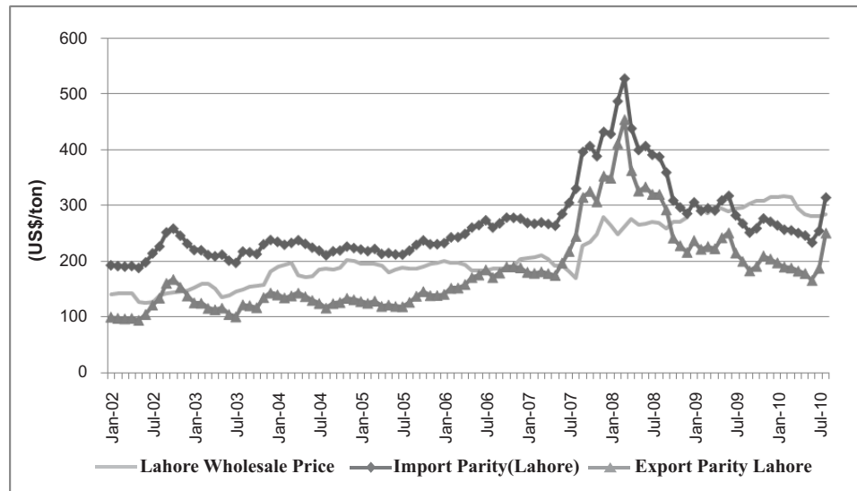
Fig. 3. Pakistan Domestic and International Wheat Prices, 2002–10

Thus, it was unclear whether or not the recent floods would have major effects on the wheat market. Kharif season rice and maize crops account for only a small share of cereals consumed in Pakistan, and a decline in their availability has relatively little effect on wheat demand or wheat prices. Depending on further developments in world wheat markets, the extent to which flood damage affects Pakistan's 2010-11 harvest, and domestic wheat demand, private-sector wheat imports may provide a zero-fiscal-cost means of stabilising domestic wheat prices at an acceptable import parity level in the coming year.